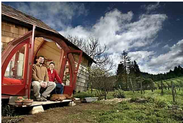
Chronicle / Craig Lee

The Porter Bass Estate sits just up in the hills that overlook the small town of Guerneville, CA (below the fog line, 9 miles from the Pacific Ocean). The vines struggle to ripen each year, providing the perfect environment to make balanced expressions of Coastal Russian River Valley wines. The property is 25 acres under vine (primarily planted to Pinot Noir and Chardonnay, with a 2 acre Zinfandel parcel named Dot's Garden). The Estate dates back to the late 1800's: planted to Zinfandel & Palomino (while the Palomino is long pulled up, some of the original Zinfandel vines still exist in Dot's Garden).